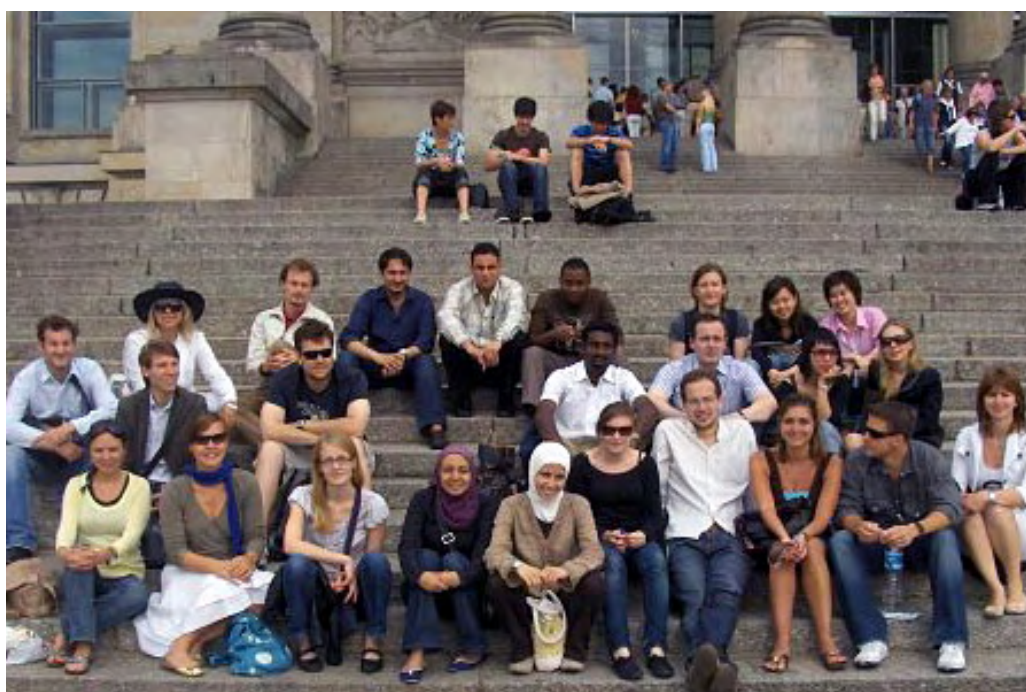
The group in front of the Reichstag, the seat of the German parliament