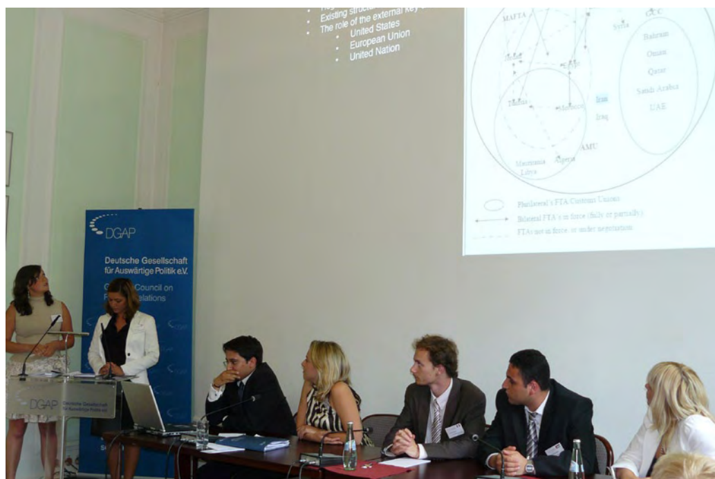
Complex regional security complexes in the Middle East

The applicability of multilateralism in the MENA region (or the interest in multilateralism among MENA nations) remains questionable, since classical rivalry among countries exists and three groups of tension can be identified: Iran vs. the Arab world, Israeli vs. Palestine, and rivalry among Arab states. In the 1960s, radical Arab regimes contested the legitimacy and power of traditional monarchical states. In the 1970s, Islamic fundamentalists rejected the prevailing secular order and sought to set the region on the path to God. In the 1980s, much of the Arab world supported the genocidal Saddam Hussein as he sought to displace Iran's theocratic regime. Today, MENA is fracturing once more, this time along sectarian and confessional lines, with Sunnis clamoring to curb Shiite ascendancy. Furthermore, bilateral treaties between countries in the region and between MENA nations and the United States have been seen as much more relevant than multilateral cooperation. In this system of disunity, each state places its domestic interests before regional or sub-regional interests, which then results in the malfunctioning of private and public regional and sub-regional organizations. The mentioned rivalries also make the emergence of a regional power impossible, since a regional leader should be accepted within the region and enjoy international credibility and support. (...)