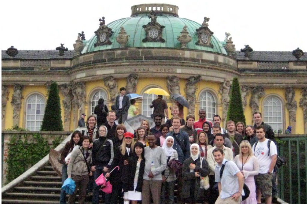
With rain, but sans souci: Participants enjoy the trip to Potsdam