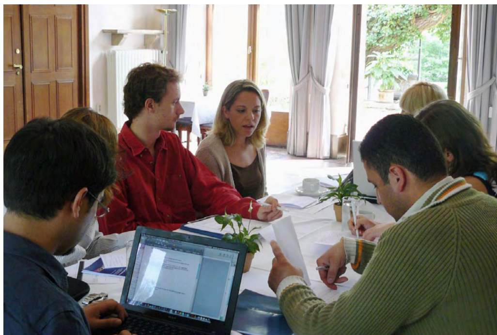
Intense preparations for the MENA group's policy paper

Hence, dynamics in this sector enhance the role of external actors. The US plays a significant role. Oil-producing states would increasingly have a lot at stake in prioritizing US foreign policy in the region. And since the US has strong economic interests in the region, it consequently provides significant financial as well as military and political support to some governments and strives to isolate others. Such actions, combined with the US lack of confidentiality in the region, have caused an inferiority complex to develop in the Middle East and North Africa. By