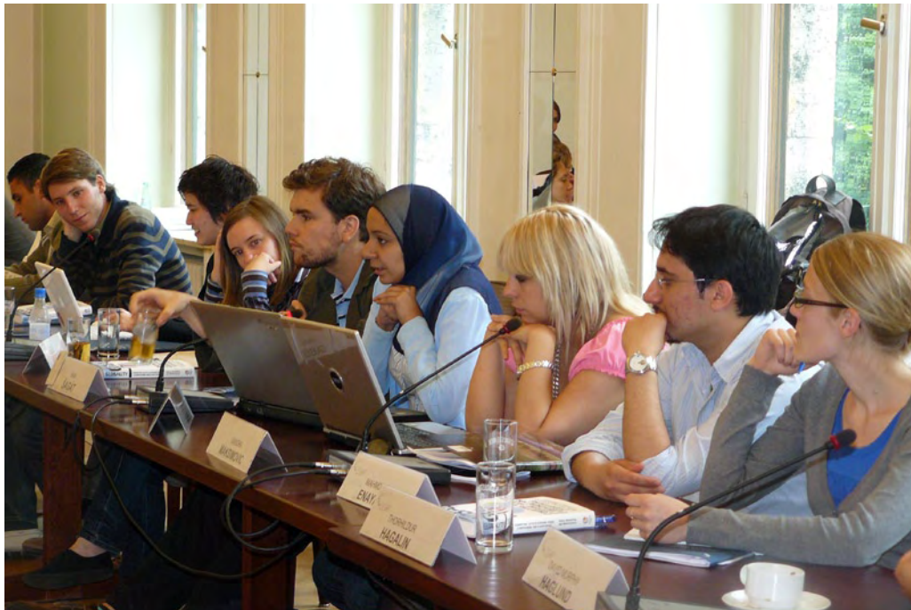
Participants discussing in DGAP's Robert Bosch Saal, the lecture hall of the Summer School