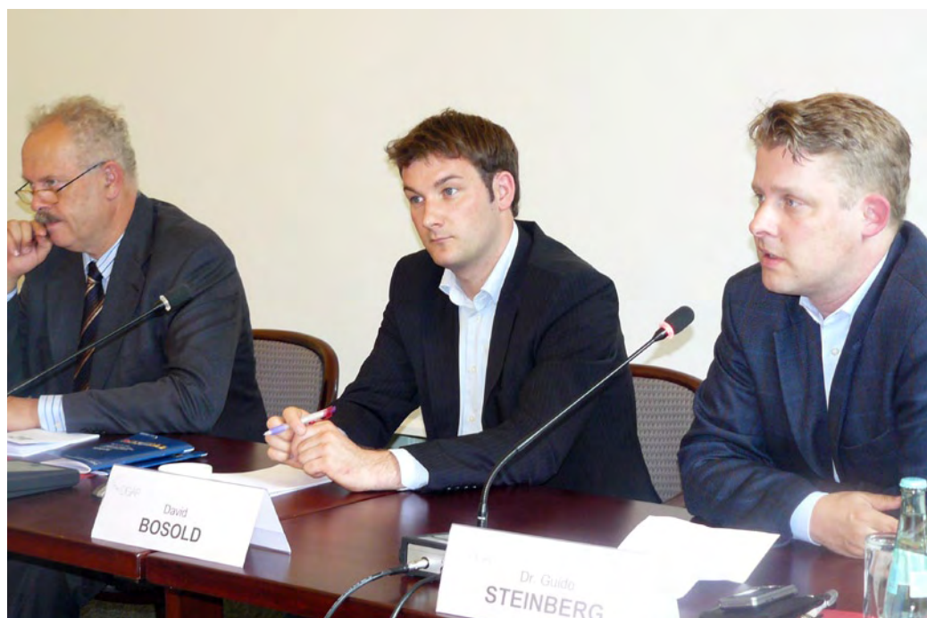
Miroslav Gregorič and Guido Steinberg address the challenges of WMD and terrorism

H. E. Urmas Paet, Minister of Foreign Affairs, Republic of Estonia