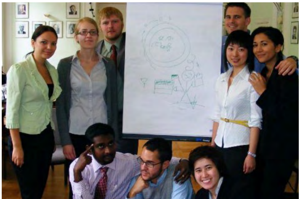
Contemplating regional leadership in Asia and learning from each other ...