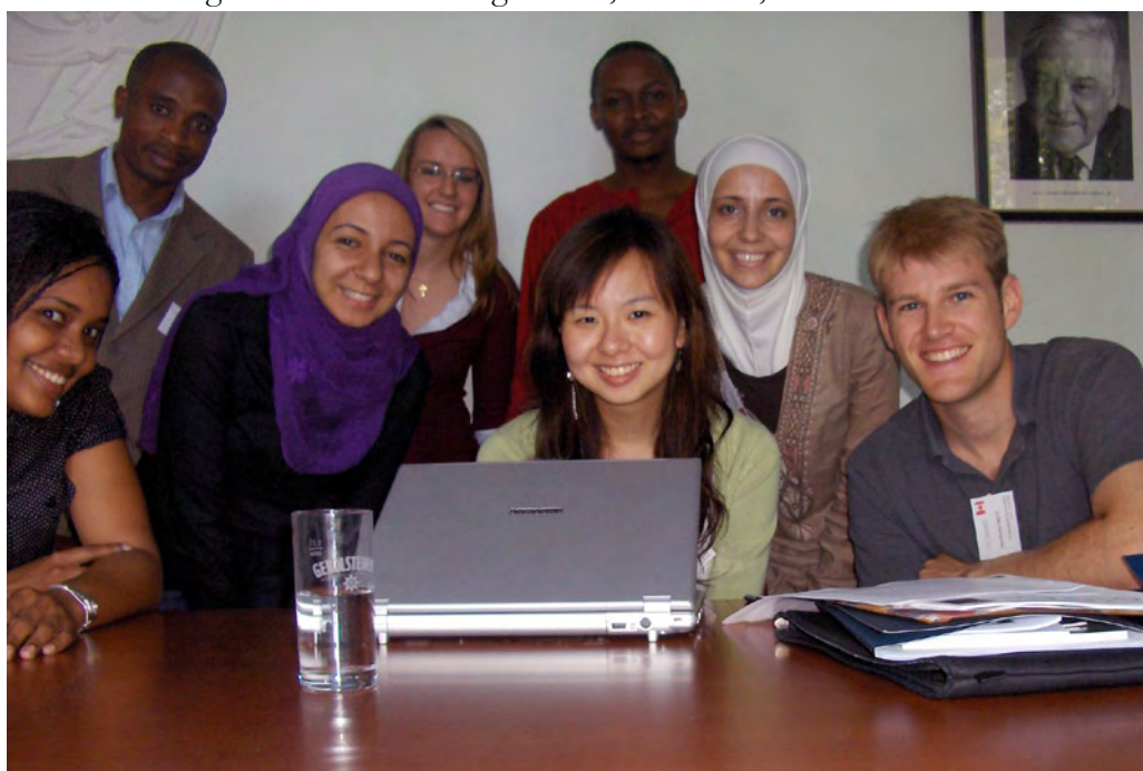
Relief and smiles after finishing the work in the Africa group

It is from this starting point that our research paper addresses the issue of regional leadership in Africa. And an appropriate starting point it is, because the problems of Africa are easier to conceptualize if we see the continent as a collection of distinct regions. While these regions do, of course, interlink with each other