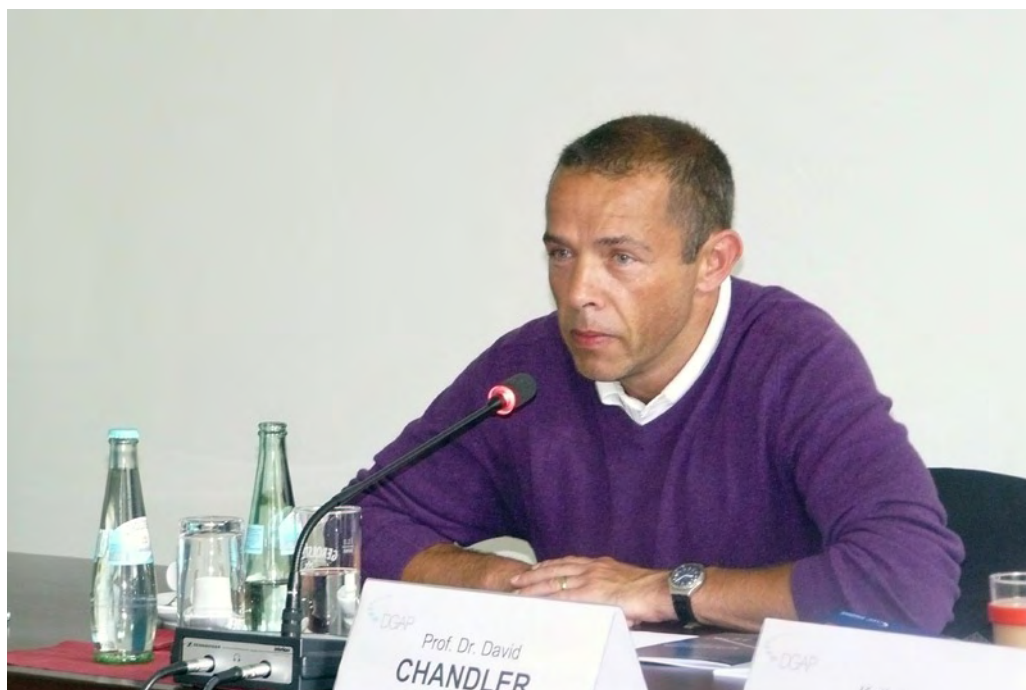
Professor Chandler critically engages with current state-building agendas