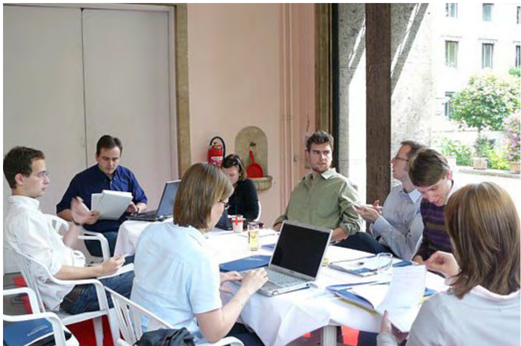
The Europe Working group debates in the DGAP's winter garden.

In certain areas the interests of these regional leaders are conflicting. The issue of democracy promotion is the most obvious example in this regard. Russia poses no immediate security threat to the EU, however, and if as stipulated by the ESS, democracy promotion is understood to serve pragmatic interests rather than ideological ones, the EU could make a case for dealing with Russia as it is. Russian influence on the global stage—for example in the UN Security Council—certainly hampers